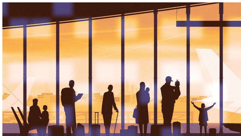
illustration: daniel stolle

The West faces an unprecedented number of new arrivals